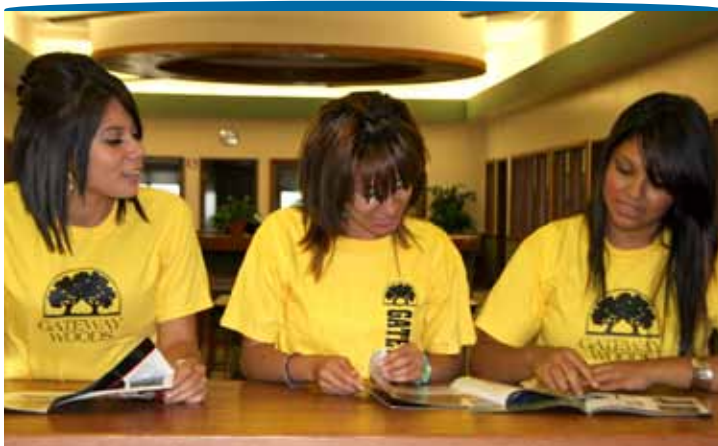
Three residents browse through some magazines in the school library.

Now, eight years have come and gone and a lot has happened during that time. I have been blessed by so many brothers and sisters who have become part of my life due to Gateway Woods. I was able to see the beginning of the school as I started on the Board. With tremendous support and with God's leading, we added two new Residential homes and converted our Oak House to help the lives of expectant teen mothers. What a blessing that has been! I remember wrestling through that decision with the Board and a prayerful and faithful Gateway Staff. We also officially began doing adoptions at Gateway during my time on the Board.